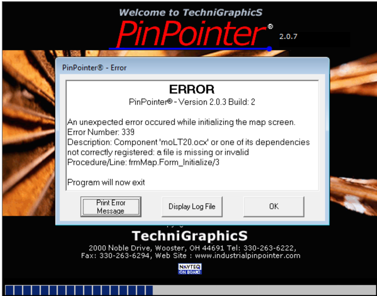
Figure 1: PinPointer error number 339 notification

Sometimes, due to a change in how permissions are handled between versions of windows, the following error may occur when PinPointer is started for the first time: