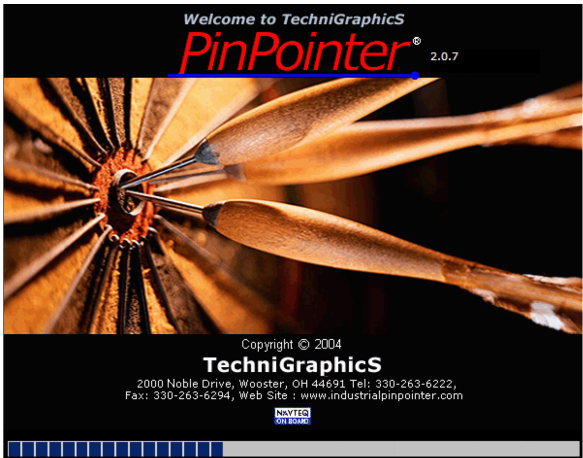
Figure 4: PinPointer loading screen